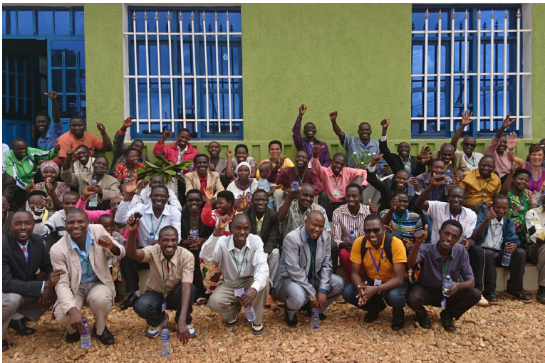
'Leadership for Life' training in Burundi

Emerging Leaders is a charitable organisation that works to support vulnerable communities across Africa through leadership training. This allocation funded four sets of 'Leadership for Life' training, two in Uganda in partnership with a charity called Every Life, and two in Burundi via a network called GLO, all of which have received positive feedback. The charity is planning to return to Burundi in 2018 to build upon those they have worked with by running a 'Train the Trainer' programme which will enable the most promising participants to share the 'Leadership for Life' programme further into their existing networks and organisations, including schools and government departments.