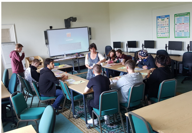
Left: Fusion Housing Right: Onside, Youth Zone

The Foundation also made a donation of £25,000 to national charity Place2Be, to support its work with children, parents and teachers in schools and nurseries based near Grenfell Tower. The Foundation wanted to provide immediate relief support to the affected community, and Place2Be, which had been established in the community prior to the tragedy, made this possible. It provides expert counselling and support to parents and adults in the community as a member of the Support 4 Grenfell Community Hub.