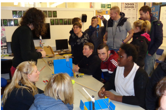
Left: New Reflexions, Bridges Evergreen Holdings Right: Shaw healthcare, Bridges Evergreen Holdings

Governance costs for the Foundation were slightly lower than the previous year at £9,214 (2017: £32,625), covering legal and audit fees. Administration and investment services are performed by Bridges Fund Management Limited on a pro bono basis. It is not possible to quantify the value of this work.