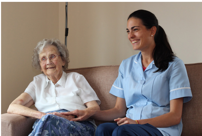
Left: Shaw healthcare Right: The Ethical Housing Company

Following these deals, Evergreen had invested or committed most of its original capital. So, it went back to market, and we're pleased to report that since the end of the period, it has been able to raise a further £27m of capital, taking its total assets above the £50m mark. This is a strong endorsement of the Evergreen model, and a helpful validation of the Foundation's original decision to commit to the first close in the hope of catalysing others.