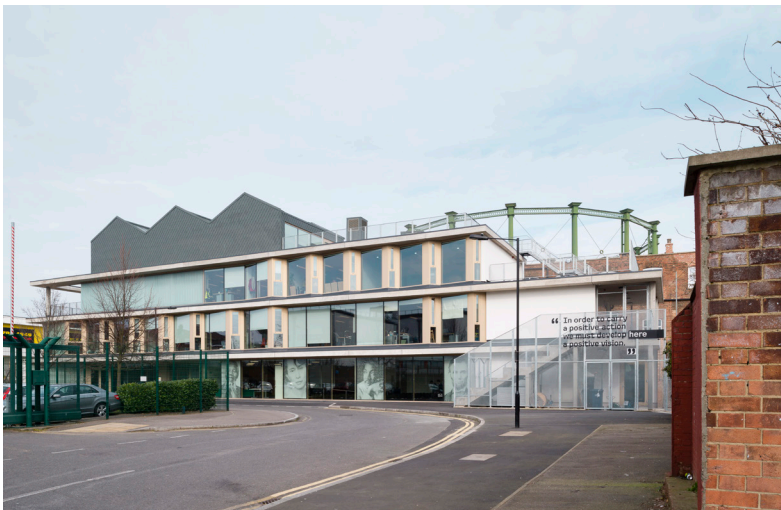
Left: The Foundry, Bridges Social Entrepreneurs Fund Right: HCT, Bridges Social Entrepreneurs Fund

The charity does not engage in fundraising activities and no donations are sought from the public. The Foundation does not use third parties to assist with fundraising and the charity received no complaints in this year regarding its fundraising practices