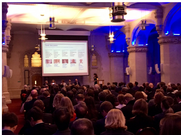
Left: Launch of the UK NAB report at the London Guildhall

The Trustees strongly believe that if some of these recommendations carry through into policy, it could unlock substantial funding to help address some of the UK's most pressing challenges, as well as help create a more inclusive and sustainable economy for the future. In other words, the goals of the UK NAB, and the GSG more broadly, are very much in line with those of the Foundation; so we're delighted to have been able to support its important work during the period.