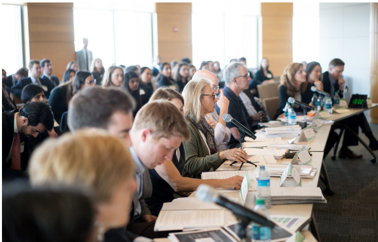
2018 MIINT finals hosted by the Wharton Business School