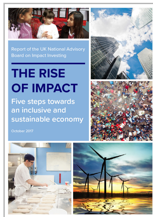
Right: UK NAB report, The Rise of Impact