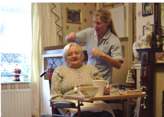
Left: CASA, Bridges Social Entrepreneurs Fund Right: LEYF, Bridges Social Entrepreneurs Fund

All told – taking into account both SIBs and Evergreen – the Foundation's original catalytic seed funding of SEF has effectively enabled Bridges go on to raise almost £100m of additional capital to support highly impactful charities and other mission-driven enterprises.