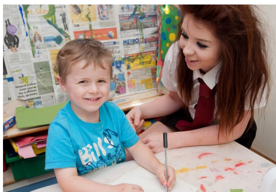
Left: Teens & Toddlers, Bridges Social Impact Bond Fund Right: LEYF, Bridges Social Entrepreneurs Fund

During the period, the Foundation adopted revised articles of association which clarified and extended the number and composition of the board of Trustees.